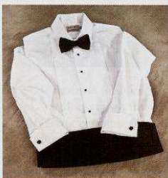
White Pleated Tuxedo Shirt with a Straight Collar With Studs and Cuff Links